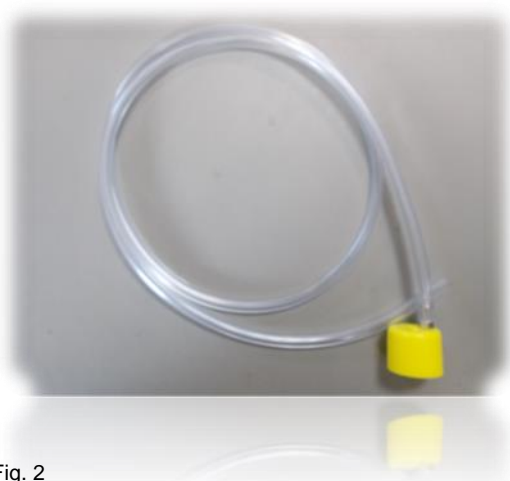
Fig. 2 Calibration adapter C2Z4