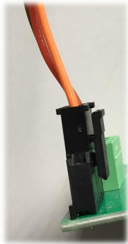
Fig. 3 SC2 connection to Basic Sensor Board